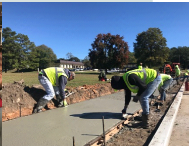
City of Atlanta workers build a new sidewalk in front of Sadie G. Mays.