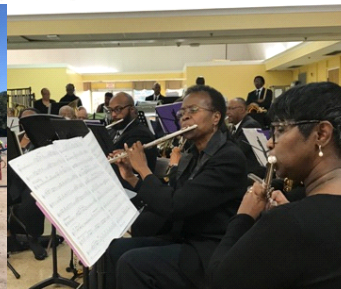
Metropolitan Atlanta Community Band plays at SGM Thanksgiving Concert Nov. 23.