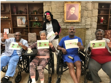
SGM residents help to promote Giving Tuesday on Dec. 3.