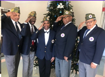
Members of the AMVETS #44 salute after a holiday visit with residents.