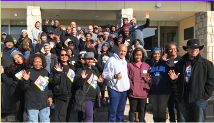
MLK Day of Service, Jan. 20, brought 75 volunteers from Citizens Trust Bank, KaVo Kerr, and Greenforest Community Church to work and visit SGM residents.