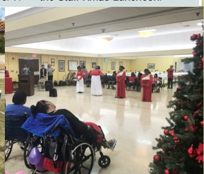
Residents enjoy dancers at the Annual Christmas Tree Lighting program.