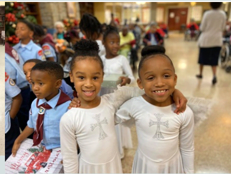
Little "angels" of the West End 7th Day Adventist Church pose together after performing at Xmas Tree Lighting, Dec. 7.