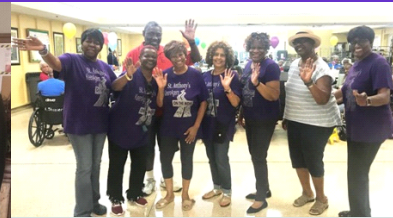
The "Keenagers" of St. Anthony of Padua Catholic Church help with monthly birthday parties.