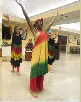
Total Dance/Dancical Productions performs for Kwaanza Dec. 27.