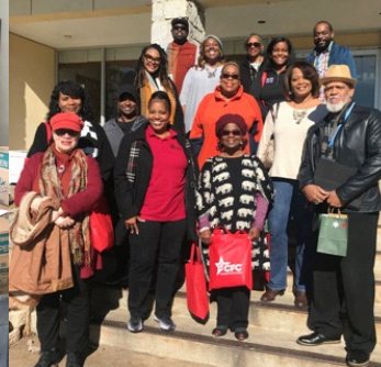
Federal employees came to SGM on the CFC "Show Some Love" tour on Dec. 5.