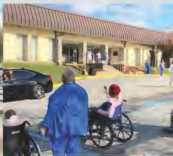
Family members wave at residents and staff during Thanksgiving Day Family Parade.