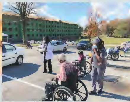
Residents are lined-up to greet family members at the Thanksgiving Day Family Parade.