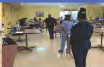
Staff members line-up for their COVID-19 vaccines from CVS pharmacists.