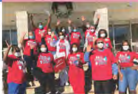
Staff demonstrates their team spirit while wearing t-shirts that read, "Our Residents Are The Coolest!"