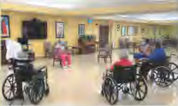
Activity aide, L. McCrimmon, leads residents in a Get Fit While You Sit exercise session.