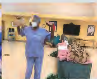
Thanks to the ladies of the Pi Alpha Omega chapter of Alpha Kappa Alpha sorority for donating lunches for our staff in honor of Care for the Caregiver National Impact Day.